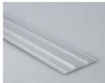
Aluminum Profile B