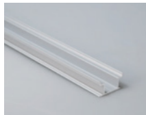
Aluminum Profile A