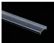
Clear Lens (CL)