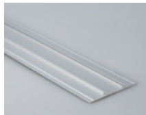
Aluminum Profile B