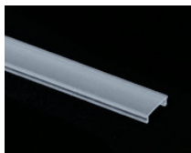
Frosted Lens (FR)