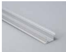
Aluminum Profile A