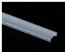
Frosted Lens (FR)