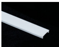
White Lens (WH)