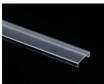
Clear Lens (CL)