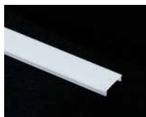
White Lens (WH)