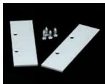
End Caps (EC)