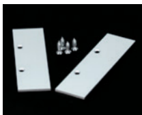
End Caps (EC)