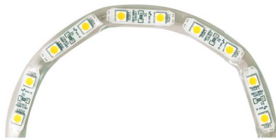
4" Max Bend Diameter

Conforms to ANSI/UL Standard 2108 Certified to CAN/CSA Standard C22.2 No. 250.0