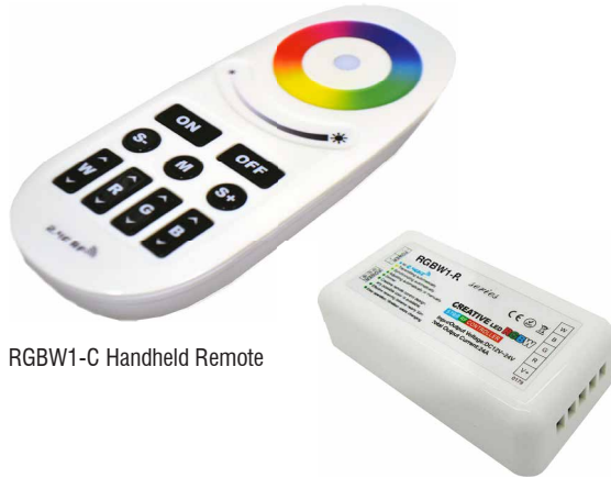
RGBW1-C Handheld Remote