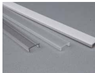
Clear lens (CL) Frosted lens (FR) White lens (WH)