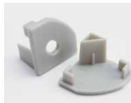
End cap with hole End cap without hole