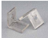
Mounting clip (CP)