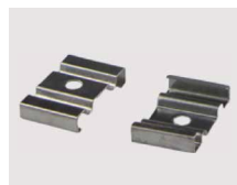
Mounting clip (CP)