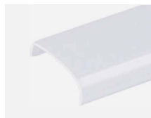
Clear lens (CL) Frosted lens (FR) White lens (WH)