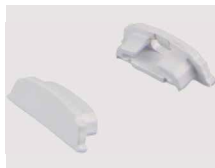
End cap with hole End cap without hole