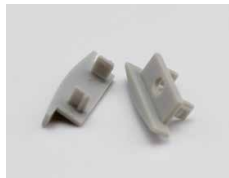
End cap with hole End cap without hole