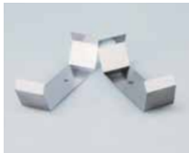
Mounting Clips (CP)