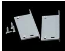
End Caps (EC)