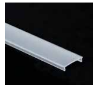
Frosted Lens (FR)