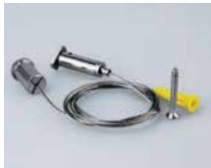
Suspension Cable (SP)