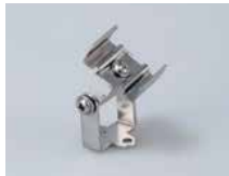
Pivot Mounting Clip (PV)