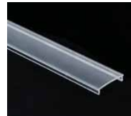
Clear Lens (CL)