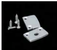
End Caps (EC)