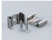
Mounting Clip (CP)