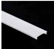
White Lens (WH)