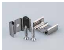
Metal Mounting Clip (MT)