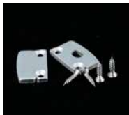
End Caps (EC)