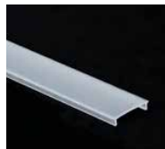
Frosted Lens (FR)