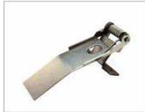
Mounting clip (CP)