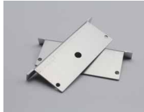
End cap with hole End cap without hole