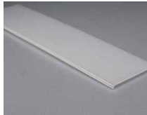
Frost lens (FR)