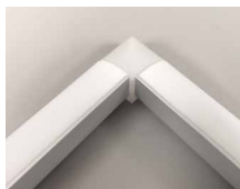
90° connector (round lens only, outside corner only) not included Part# CH-C-016-90