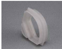
Straight coupler included with round lens option