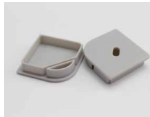
Square end cap with hole Square end cap without hole