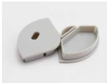
Round end cap with hole Round end cap without hole