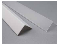
White square lens (WHS) Frosted square lens (FRS)