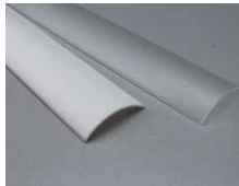
White round lens (WHR) Frosted round lens (FRR)