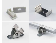
End cap with hole End cap without hole Mounting clip (CP) Pivot clip (PV)