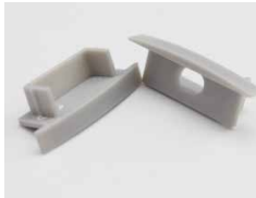
End cap with hole End cap without hole