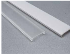
Frosted lens (FR) White lens (WH)