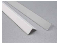
White square lens (WHS) Frosted square lens (FRS)