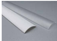
White round lens (WHR) Frosted round lens (FRR)