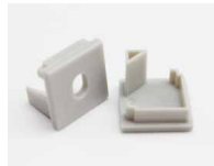
Square End cap with hole Square End cap without hole